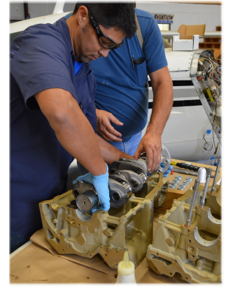
Above shows the type of things I have been doing during my apprenticeship.

Upon our arrival to Oklahoma and Alpha Aviation we went through two weeks of orientation and in the end we were commissioned as missionaries with the ministry. At the beginning of October I started my aircraft mechanic apprenticeship. We work at least 40 hrs a week pulling apart, repairing, and rebuilding planes. In October we worked on 8 different planes. This is why I'm so excited about the type of schooling I am receiving; I will get extensive hands on training so that I can fix just about any engine problem. I have also been able to get few hours of flight time as well.