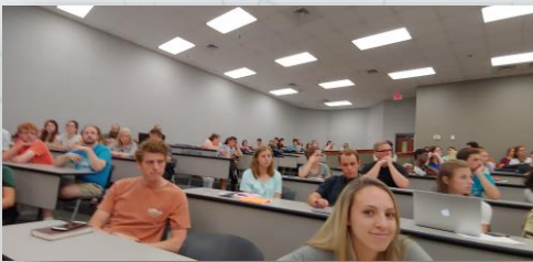
The Harding Global Outreach meetings have started