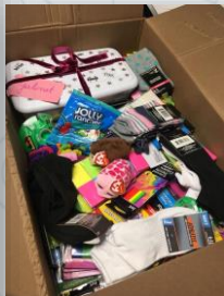
One of our projects as a Youth Group