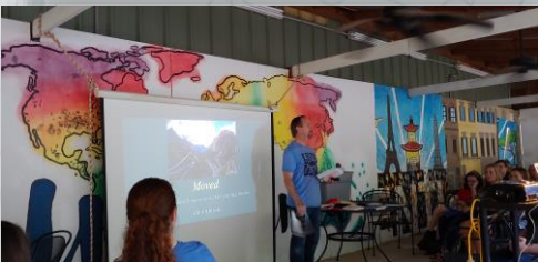
Bible Majors Retreat