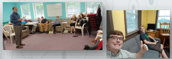
We surely love these kids!