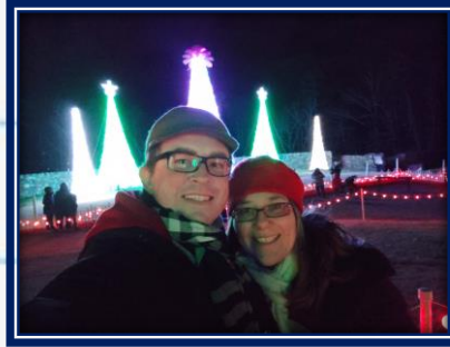
Trip to Hot Springs