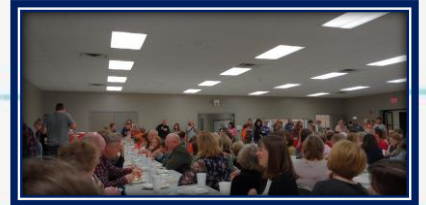
Cloverdale Chili Cookoff