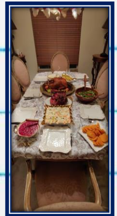
Brazilian/American Thanksgiving dinner