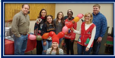
Youth Group Christmas Party