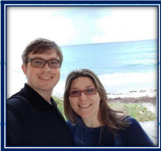
Florida is beautiful!