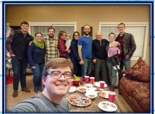
Back in Searcy, sharing, dreaming and praying about our Florida plans.