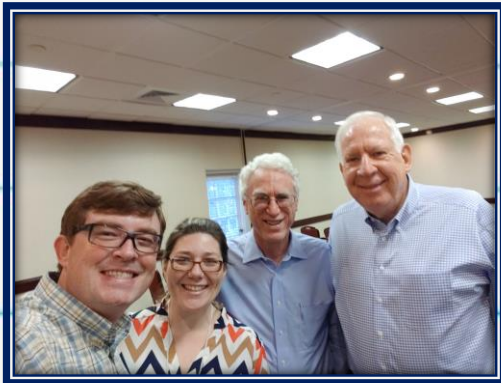
The elders of the Hialeah CoC